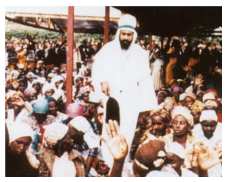
Maitreya as he appeared in Nairobi in 1988.

Political changes - In the political arena, for almost three decades we have been witnessing the breakdown of old repressive regimes around the world and the exposure of rampant corruption in government and business. Several major unexpected events have taken place, made possible only by Maitreya's influence: apartheid ended in South Africa with the election of Nelson Mandela to the Presidency, following his release from an unjust, 27-year imprisonment. The Soviet Union dissolved into independent states. The Cold War ended, and East and West Germany reunited after the destruction of the Berlin wall. And, increasingly, governments around the world have had to give way to the "voice of the people."