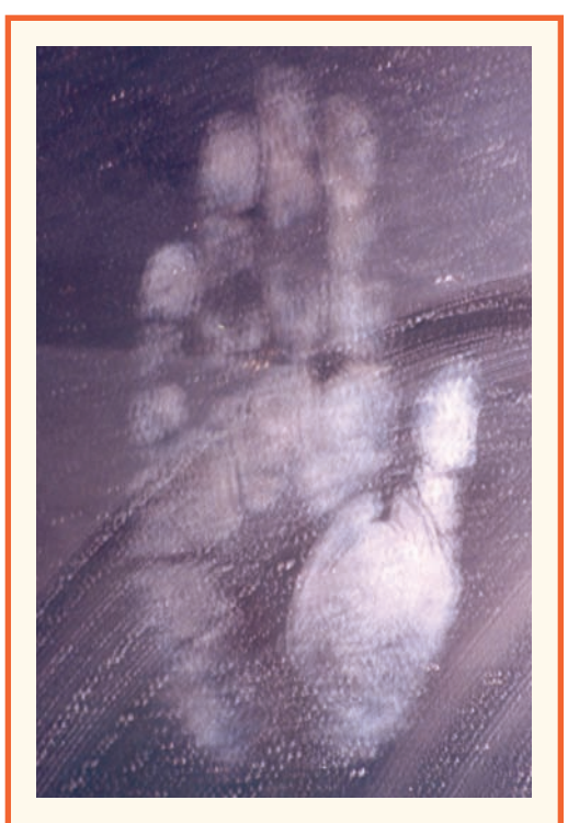
This handprint of Maitreya, manifested on a bathroom mirror in Barcelona, Spain is similar to the print on the Turin Shroud and three-dimensional in appearance. When you place your hand over it, or simply look at it (or a photocopy of it), you are in effect calling forth Maitreya's healing, blessing or help—whatever is possible within karmic law. Until he emerges fully and we see his face, this is the closest that Maitreya can come to us.

Esotericism defines God as the sum total of all the Laws, and all the energies governed by these Laws, which make up everything in the